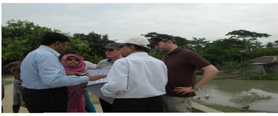
Field trip in the coastal areas of Dacope Upazila, Khulna

As a part of the workshop a team of nine, including two members from APFM, attended a 2- day field trip in the coastal areas of Dacope Upazila Sub-district) on 27 and 28 October, 2014. They have observed the present coastal flooding due to the effects of climate change and corresponding mitigation measures to be implemented under Coastal Embankment Improvement Project, Phase-1 (CEIP-1).