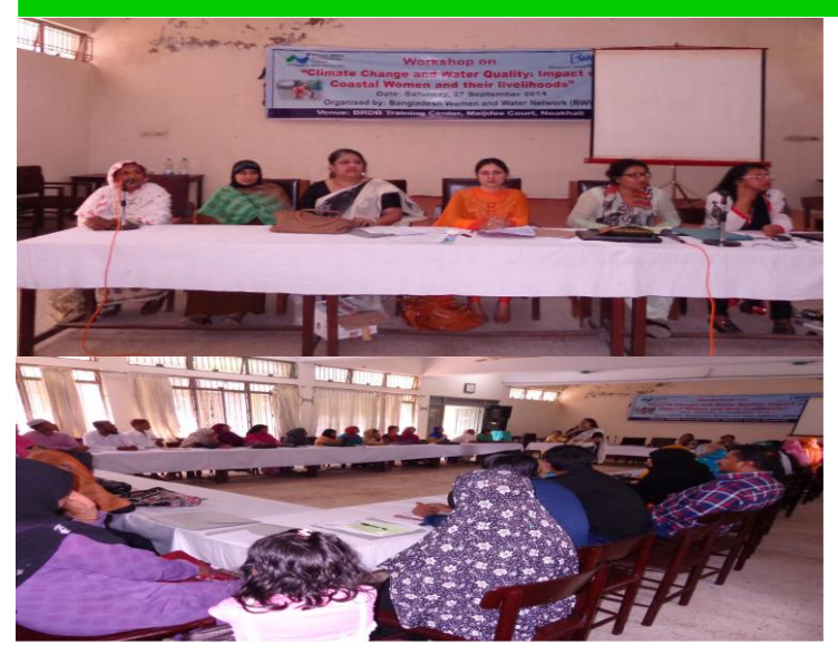
The coordinator of BWWN is conducting the training session

Bangladesh Women and Water Network (BWWN) with the financial support of Bangladesh Water Partnership organized a half day long workshop on 27 September 2014 in BRDB Training Center, Maijdee Court, Noakhali. Title of the workshop was "Climate Change and Water Quality: Impact on Coastal Women and their livelihoods". The workshop was designed for grass root level female participations. The purpose of the workshop was to enhance awareness among the participants and share knowledge in the perspective of climate change issues and develop local level network. A total number of 49 participants, from different water user groups, projects, local women organizations, local NGOs working with water, students etc., participated in the workshop. Two award recipients Mrs. Morium Begum and Mrs. Rup Bhanu, Laxmipur who are well recognized as role model in grassroots level, spoke in the workshop to share their practical knowledge and experience on their self reliant activities in IWRM sector.