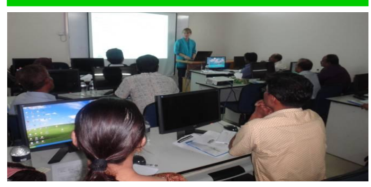
Business session of the training program

Bangladesh Water Partnership in collaboration with Institute of Water Modelling (IWM) conducted a 5 day training program on 'Capacity Building for Climate Change Adaptation' from March 9-13, 2014. The aim of the training program was to increase awareness of the key critical issues related to the training theme. The training was attended by 14 mid-level professionals from 7 different local stakeholder agencies viz. Bangladesh Water Development Board [BWDB], Local Government Engineering Department [LGED], Bangladesh Agricultural Research Council [BARC], Department of Agricultural Extension [DAE], NGO Forum for Public Health, Department of Public Health Engineering [DPHE] and Water Resources Planning Organization [WARPO]. The training program included 15 lecture sessions by resource persons drawn from local experts covering various important issues such as Agriculture & Food Security, Water Supply & Sanitation, Infrastructure & Flood Management, Gender, Mainstreaming and Cross-Cutting issues. The entire lecture series included contributions from 20 experts from various sectors. The participants were all awarded certificates at the concluding session of the training program which was jointly done by Prof. Dr. Monowar Hossain, Executive Director, IWM and Dr. K.Azharul Haq, Vice President, BWP.