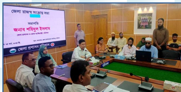
BWP and RUN Barishal hosted a program on water resource conservation, forming a task force and promoting IWRM and nature-based solutions.

Bangladesh Water Partnership (BWP), in collaboration with RUN, Barishal, organized a program to amplify youth voices in addressing the degradation of natural water resources, associated hazards, and challenges in development accountability. The program featured case studies and video documentation, highlighting environmental hazards, conservation needs, and sustainable infrastructure development. Key discussions led to the formation of a district task force to assess encroachment, prepare a master plan with detailed documentation, and estimate budgets for demarcation, eviction, and conservation of canals and rivers. The Deputy Commissioner emphasized the need for long-term planning and committed to presenting the recommendations to the Ministry of Water Resources for phased implementation. The program raised awareness of Integrated Water output to the financial assistance