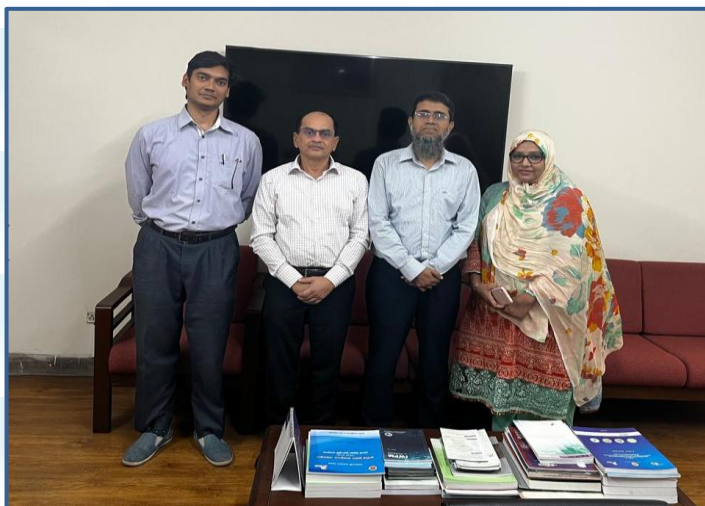
Strategic meeting between BWP and IWFM, BUET

On May 6, 2024, the Bangladesh Water Partnership (BWP) and the Institute of Water and Flood Management (IWFM), BUET, held a strategic meeting at IWFM, BUET. This meeting emphasized strengthening their partnership, aligned with the goals outlined in their Memorandum of Understanding (MoU).