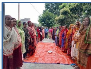
CBO and Youth groups