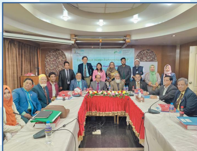
21st Annual General Meeting (AGM) of BWP at Executive Engineer Office, LGED, Dhaka.