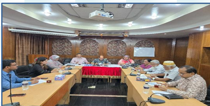
BWP Executive Committee Meeting

The EC Meetings (83–84 th , 85 th , and 86 th ) were held respectively on 04 May, 12 July, and 09 November 2024. The main agenda of the meetings included discussion on the WIN Project on WASH, Informal Settlements & Integrity (WISI), initiatives and scope for locally raised funds, Change of EC Member from NGO, selection of new EC Member from IWFM, BUET, appointing new Accounts Officer of BWP, etc.