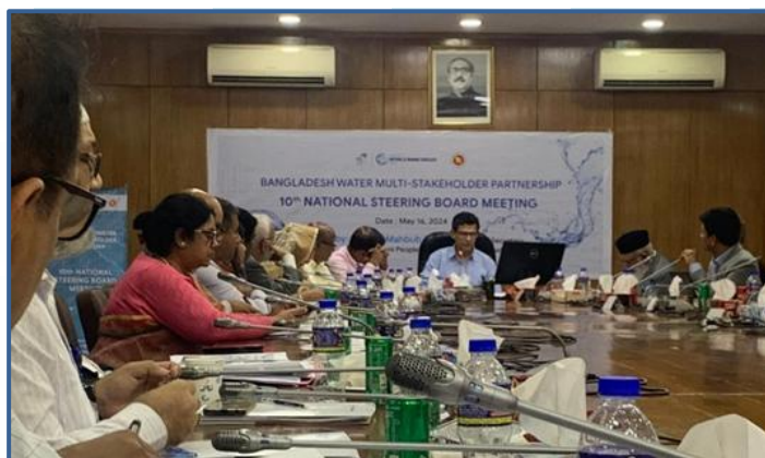
Bangladesh Water Multi Stakeholder Partnership-10th National Steering Board Meeting supported by BWP

BWP provided technical support in Bangladesh Water Multi Stakeholder Partnership-10th National Steering Board Meeting held in May 2024. The meeting was chaired by the Cabinet Secretary where BWP was recognized for its prestigious role in providing technical support to WRG 2030, highlighting its commitment to sustainable water resource management.