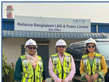
BWP's Meghna River visit promoted corporate water stewardship with Hamdard WAQF and Reliance Bangladesh under the Water Replenishment Project.